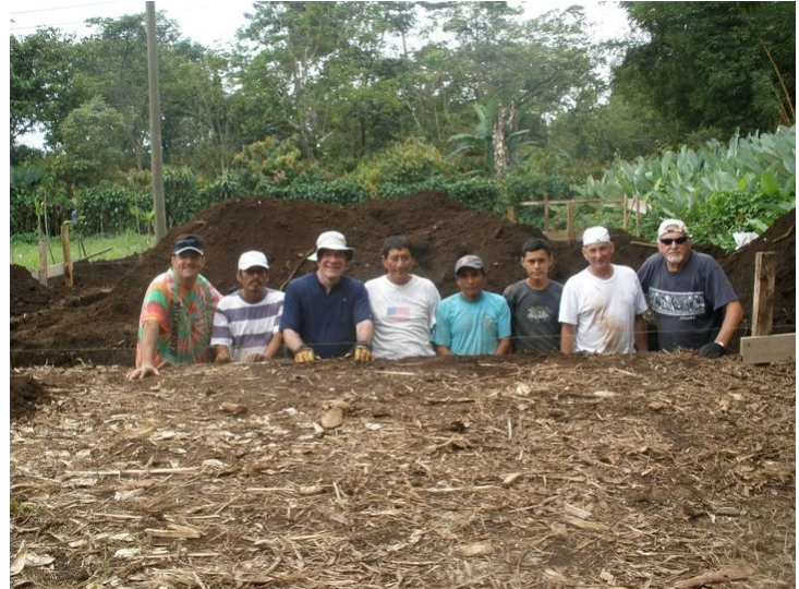
THE BIG DIG. In Guatemala, an energetic team goes to many depths digging foundations, running children's program and caring for people in the clinic this November.

Guatemala stayed quietly in the back ground during the earthquake year. Despite our work in Guatemala receiving less attention, so much was accomplished in 2010 that confirms to us