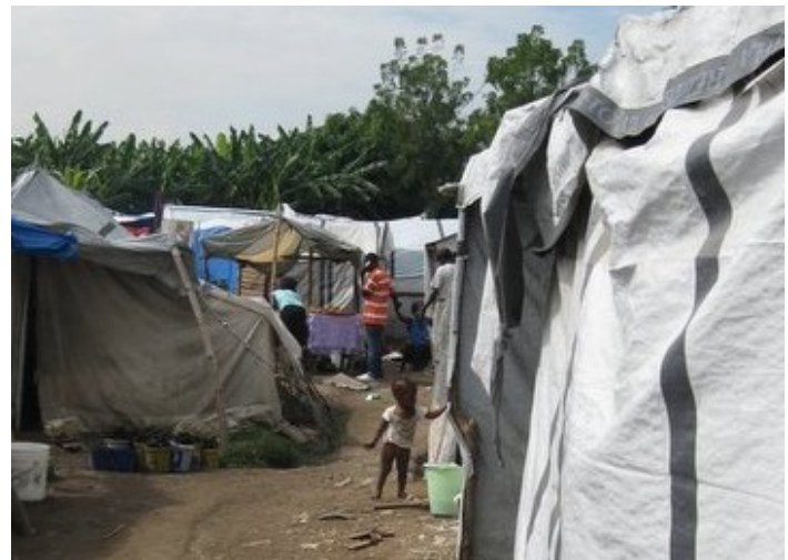
HOME SWEET HOME? PID's new tent village program in Haiti will assist those living in the tent villages of Canaan and Damien. PID will offer its existing program to these tent cities.

Looking ahead, Hull then announced PID's 2011 new initiatives. The initiatives will compliment PID's current services in both Haiti and Guatemala. The goals include expanding Haiti's medical clinic, completing the new medical clinic in Guatemala and starting a tent village pro-