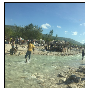
Pictured: A river created by the hurricane.

As we drove back to Port-au-Prince the car was filled with silence. We were all processing what we had seen. Life was something that wasn't easy for these people before this hurricane, but the reality of the damage and how many lives were lost was heart breaking. With every small bit of aid a life is changed forever. If you would like to help with hurricane relief we will continue to take donations. One hundred percent of your donation will go to a family who we will verify has substantial loss. Thank you for caring.