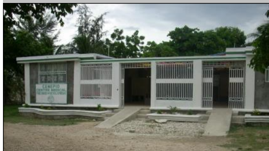
PID's Medical Clinic in Blanchard, Haiti serves 26,000 people a year, providing free, quality primary care to those who could not otherwise afford it.

PID is proud to announce that we have received our public clinic license from the Ministry of Health in Haiti.