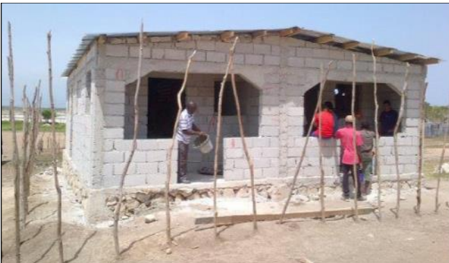
PID has currently built homes for six families in Canaan, and has permission to build many more!

My last trip to Blanchard was three weeks before the earthquake of 2010. What happened to PID following that tragic event is still burned into all of our memories. The long wait for news concerning our Haitian staff made our hearts heavy, but Haiti needed us and we somehow made a plan amidst the chaos and sprang into action.