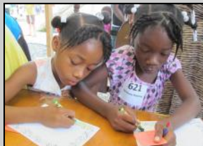
Making cards in Haiti

Think your Christmas party season was busy? Think again... Haiti was exploding with various yuletide festivities. First was the Christmas party for the 400+ sponsor children. Kids made Christmas cards for their sponsors, played games, and