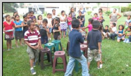
Musical Chairs at the park

Back in Haiti, the sponsored kids in the Jou Nouvo branch of PID in Bon Repos had