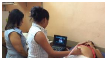
First ultrasound in our clinic in Guatemala!

Our long-awaited ultrasound machine has landed in Guatemala, thanks to several generous donors and a matching donation.