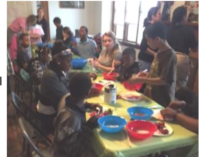
Children's cooking class

I recently returned from a service trip with Gordon College. When the kids in