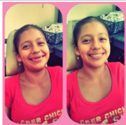
Before and after!

back you could see she was scared. The team extracted her teeth and taught her how to put in her new partial denture. When she looked in the mirror her smile lit up the room. She was hugging everyone!