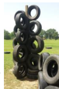
Tire playground was created with help from First Church (Ipswich) team.

"...Never be lacking in zeal, but keep your spiritual fervor, serving the Lord, be joyful in hope, patient in affliction, faithful in prayer." Romans 12: 11-12.