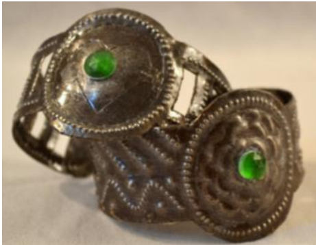
These bracelets made in Haiti feature a beautiful gem, created from re-purposed glass and placed on a band of recycled oil drum metal

Not only are they beautiful, but PID crafts are now creating revenue for our programs to benefit the poor. PID launched an Etsy shop back in the spring: www.etsy.com/shop/PIDcrafts . Over the last six months, we've been pleasantly surprised and encouraged by its progress. We've had more than 5,450 visitors from all over the world, with new people coming every day!